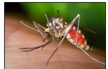
Figure 3. Aedes triseriatus

La Crosse virus (LACV) is an arthropod-borne virus (arbovirus) in the California group of viruses spread by the bite of infected mosquitoes. Most people are infected in Ohio by the eastern treehole mosquito, Aedes triseriatus , an aggressive daytime biting mosquito commonly found in wooded areas. La Crosse virus is endemic in Ohio, and Ohio has reported more human cases than any other state in the United States, averaging about 20 cases per year. As of 9/15/2018, there have been 41 cases of LACV reported in the United States, and 18 cases reported in Ohio.