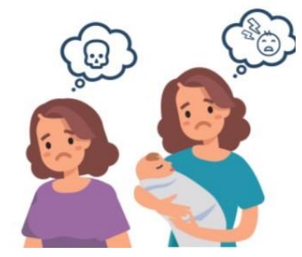
Thoughts of hurting yourself or someone else: You might have postpartum depression