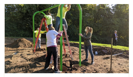
Adams Park Middlebury