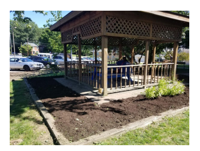
New Garden Bed Hilltop House in Barberton