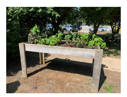
Salad Table Hilltop House in Barberton