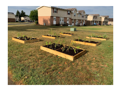
Raised Garden Beds Van Buren Homes in Barberton