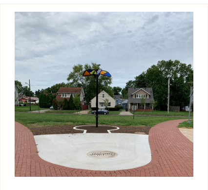
Cadillac Park Buchtel