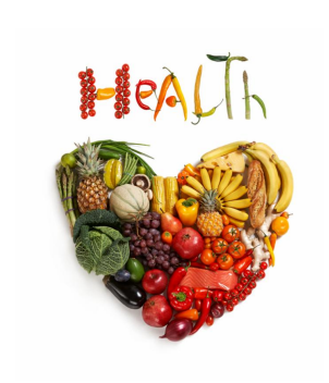
During the New Year, consider these strategies to help prevent chronic disease