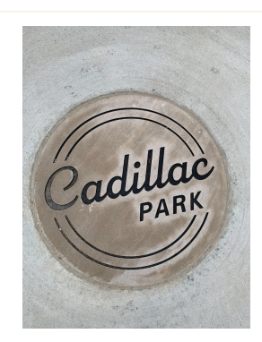
Cadillac Park Buchtel